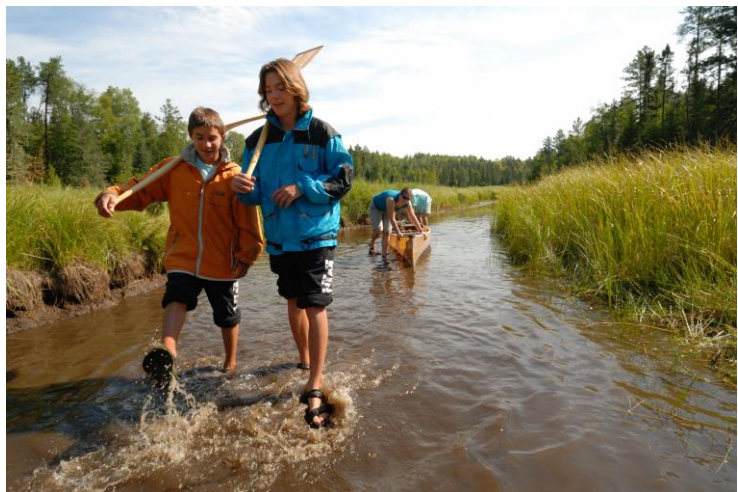
Recreation at Superior National Forest, Minnesota

Despite this uncertainty, LWCF has had positive conservation and recreation impacts throughout our country. Over its 50-year history, LWCF has protected land in every state and supported over 41,000 state and local park projects. The program enjoys strong bipartisan and popular support. A recent bipartisan poll found that an overwhelming majority - 82% - of voters support continuing to deposit fees from offshore oil and gas drilling into the LWCF. This broad support comes from every geographic region of the country, in red and blue states alike.