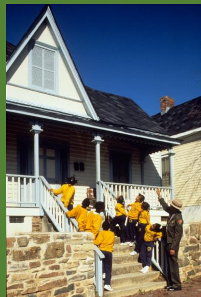
Student tour at Martin Luther King Jr National Historic Site, Georgia

The LWCF Coalition supports permanent reauthorization and full, dedicated funding for the Land and Water Conservation Fund. We are comprised of conservation, recreation, business, and sportsmen’s groups working together to support the LWCF program in order to meet America’s conservation and recreation needs in the 21st Century. Visit www.lwcfcoalition.org for more information about LWCF in your state and how you can take action.