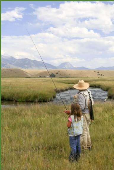
Fly fishing in Odell Creek, Montana

LWCF protects watersheds and drinking water supplies, preserves our national heritage, and conserves natural areas and open space for wildlife and recreation – all while providing sustainable, domestic jobs in urban and rural communities across America. Outdoor recreation, natural resource preservation, and historic preservation activities provide a powerful building block in our national economy that supports 9.4 million jobs and contributes a total of $1.06 trillion annually, according to the National Fish and Wildlife Federation. Whether it is close to home parks and trails or vacation destinations, LWCF provides places for all Americans to enjoy hunting, fishing, camping, picnicking, climbing, hiking, paddling, backcountry skiing, mountain biking, wildlife viewing, and other outdoor activities.