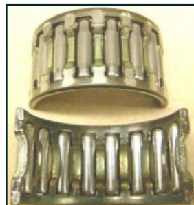
Recovered Pieces from Failed Rod Bearing